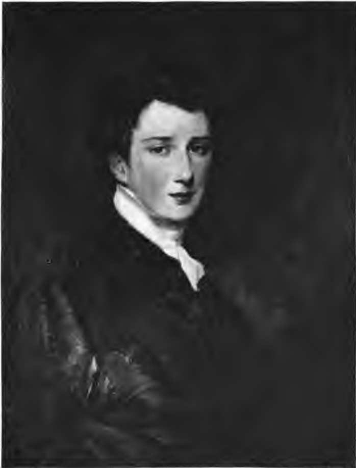
BRIAN HOUGHTON HODGSON, 1817 - ÆTAT 17.