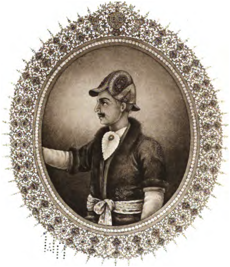
BHIM SEN THAPPA—PREMIER OF NEPAL. ÆTAT 62.